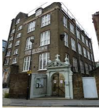
St. Joseph's Church