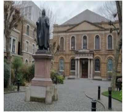
Wesley's Chapel & Leysian Mission