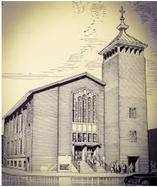
Jewin Welsh Church