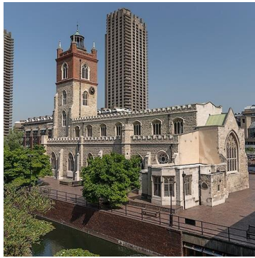
St. Giles Cripplegate