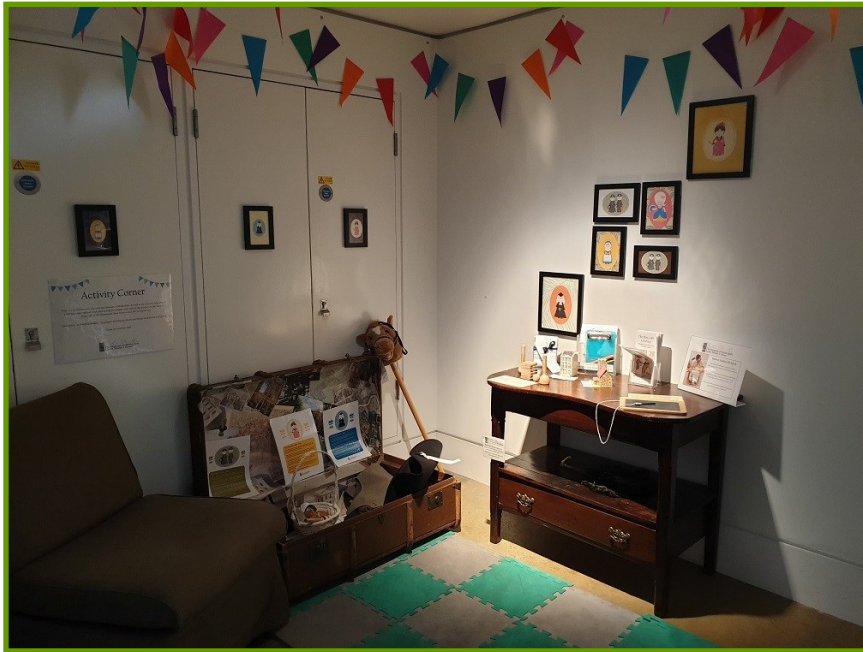
The Activity Corner. There are sensory activities and trails to help you explore the Museum.